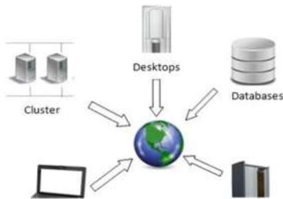
Fig. 1 Grid computing