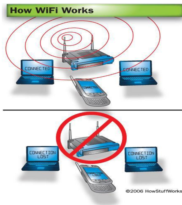
Fig. 1. One wireless router can allow multiple devices to connect to the Internet.

This vision of embeddable wireless connectivity has been in development for several years at AT&T Laboratories Cambridge in the context of the Piconet [6] project and is also being pursued, although with emphasis on different aspects, by several other groups including HomeRF [2,4], IrDA [1] (which uses infrared instead of radio) and Bluetooth [5,3]. Everyone including potential users knows that wireless networking is more prone to passive eavesdropping attacks. But it would be highly misleading to take this as the only, or even the main, security concern. In this paper we investigate the security issues of an environment characterized by the presence of many principals acting as network peers in intermittent contact with each other. To base the discussion on a concrete example we shall consider a wireless temperature sensor. Nearby nodes may be authorized to request the current temperature, or to register a "watch" that will cause the thermometer to send out a reading when the temperature enters a septic range.