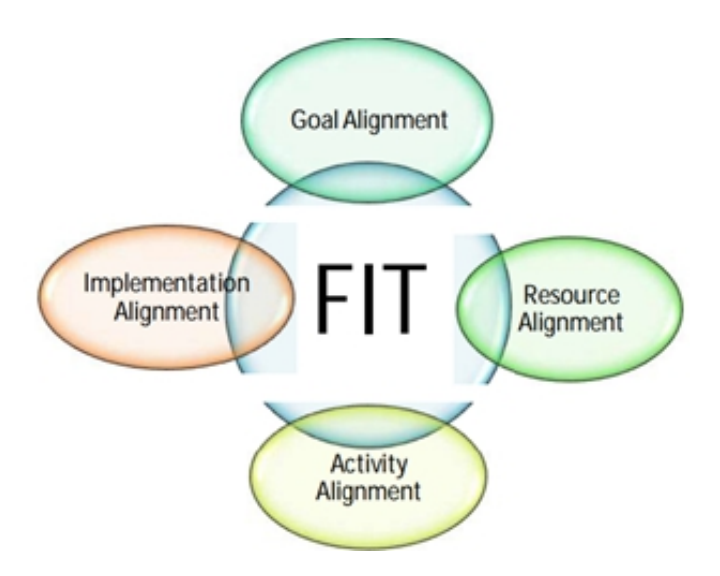
Figure 1: Assessing the Fit between Business Unit Strategy and Marketing Strategy