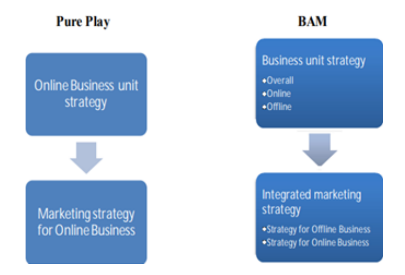
Figure 3: Marketing strategy formulation for Pure Play versus BA

The marketing decisions that a pure play and a typical "Bricks and mortar" (BAM) corporation will have to make might vary dramatically, despite the fact that both can employ Internet marketing strategy successfully on that platform. There is greater leeway in framing a product for a pure play that is just getting started than for an offline firm that is rebranding itself online. Each player will have their own unique set of choices, since this is to be expected. Figure 3 depicts the two distinct methods of conversation that take place when dealing with pure-play and BAM companies.<sup>10</sup>