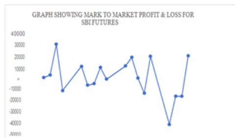
Graph 2: Showing Mark to Mark Profit & Loss of SBI Bank Futures

The subsequent table elucidates the market price and payments of calls.