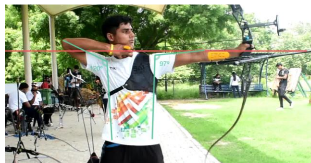
Figure 2: Angular kinematics analysis at the time of final release position in archery.

Siliconcoach Pro8 update motion analysis software and Tracker motion analysis software was used for kinematical analysis of at the time of final release position in archery. To analyze kinematical aspect of at the time of final release position in archery, Descriptive statistic was used. Pearson multi correlation was used to determine the multi correlation between the dependent variable—performance on targets 1–10 (bull eye) in points—and the independent variables—selected linear variables—at the moment of the archer's final release position. In order to determine the regression equation between the independent factors (chosen linear variables) and the dependent variable (performance on targets 1–10, or bull eyes), in points, at the moment of the archery final release position, We employed the linear regression entry method. The statistical significance was determined by setting the level of significance at 0.05. Social science statistical software (SPSS 20.0 Version) were used to analyse the data.