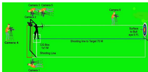
Figure 1: Diagram of the set-up of collecting data was showed in three-dimensional coordinate system is described.

Raw data was gathered using the video graphic technique. Under the guidance of an expert, a professional photographer would capture the video graphics. A high-speed camera, the Casio EX-F1, with a frequency of between 60 -300 frames per second (f/s), was reportedly employed. (Saptadeep debnath et. Al., 2016) The data were recorded from Superior view, Lateral view, Anterior view and Medial view. The distance between shooting line and target is 70 meter. Shooting line is passed horizontally through the Center of Gravity box, Center of Gravity box is a square box drawn with the measurement of 1x1 m, Center of Gravity box is equally divided into 4 parts. A straight line is passed vertically on it and a horizontal line which is shooting line and is drawn 70 meter apart from the target. The distance between bull eye of the target and the floor surface is 5 feet (figure no. 1). (Euro NCAP, 2020)