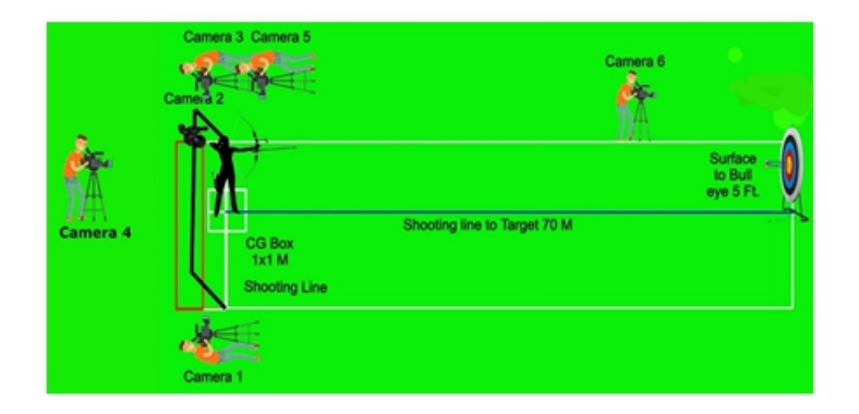
Figure 1: Diagram of the set-up of collecting data was showed in three-dimensional coordinate system is described.