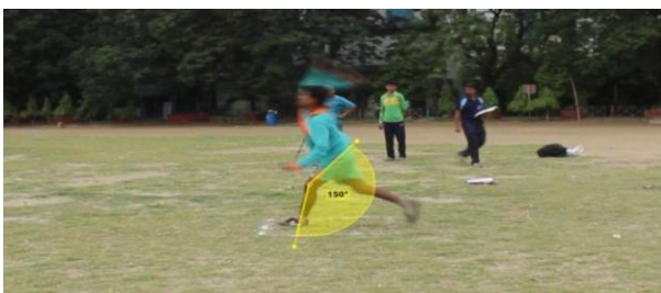
Photograph 3: Measurement of Knee Joint Angle (Left Sagittal Plane)