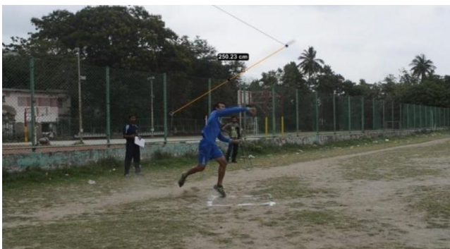
Photograph 1: Measurement of Speed of Release