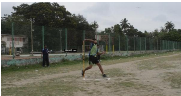
Photograph 2: Measurement of Height of Release