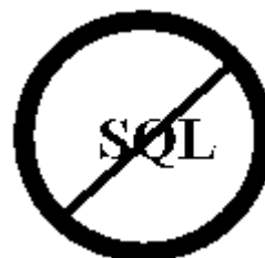
Figure 1: Symbolic representation of NoSQL

NoSQL represents Not Only SQL. It is evident as no sequel. It is among the one more type of records storing other than data sources (that were utilized previously) that is made use of to store a large volume of files storing like data on Facebook (which keeps on improving daily). NoSQL is a non-relational database management system (in some cases called as stemmed from a relational database), fast information retrieval database as well as is portable. NoSQL stems from the RDB database system. This database often communicates along with the UNIX os. NoSQL data sources are those databases that are non-relational, available resource, circulated in nature along with it is having jazzed-up in a straight way that is horizontally scalable. Non- relational database performs certainly not coordinate its information in similar desks (i.e., data is held in a non-normalized way). NoSQL databases level source; as a result, everyone may check out its code with ease, update it according to his requirements, and also compile it. Dispersed methods records are spread to different machines as well as are taken care of by various makers; thus, right here, it utilizes the concept of information replication. NoSQL might be symbolically represented, as shown in figure 1: