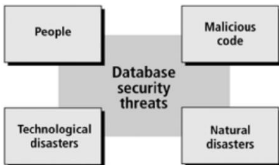
Figure 2: Threats of database security

The goal of database security is actually to protect the database from an accident or deliberate loss. These dangers position a danger on the honesty of the information and also its stability. Database safety makes it possible for or even rejects customers coming from carrying out activities on the database.