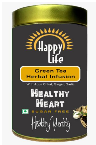
Figure 8: Happy Life's Green Tea Herbal Infusion for Heart Health (Beneficial In: Cholesterol Control, Maintaining Heart Health)