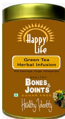
Figure 4: Happy Life's Green Tea Herbal Infusion for Bones & Joints (Beneficial In: Arthritis, Joints' pain, Gout)