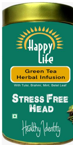
Figure 3: Happy Life's Green Tea Herbal Infusion for Stress Free Head (Beneficial In: Migraine, Stress, Depression, Anxiety, Headache)