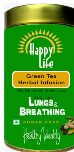
Figure 1: Happy Life's Green Tea Herbal Infusion for Lungs and Breathing (Beneficial In: Asthma, Cold, Cough, Congestion and breathing problems)

Happy Life India is an Indian based company producing healthy vegetarian food products such as Green Tea, Green coffee, Tea infusions for diseases relief, Harira, Biswar laddu, and Sugar free Herbal Paan Masaala, All the Green Tea Infusion Products of Happy Life India are most effective combination of Herbs, Kitchen spices and Green Tea for asthmatic, diabetic, arthritis, gout, migraine, heart and gastric patients. The process of grading and mixing with certain temperature and quantity wise mixing is company's distinguished quality.