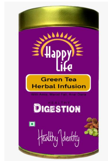
Figure 5: Happy Life's Green Tea Herbal Infusion for Digestion (Beneficial In: Gastritis, Constipation, Acidity and digestion)