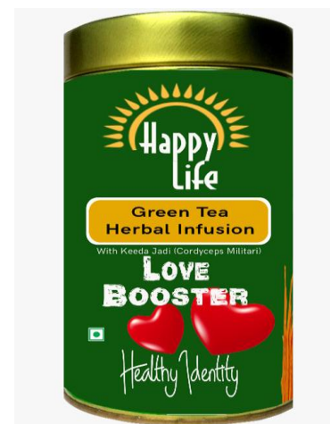
Figure 7: Happy Life's Green Tea Herbal Infusion for Love Boosting (Beneficial In: Mood Making, Boosting Desire, Mood Rejuvenation)