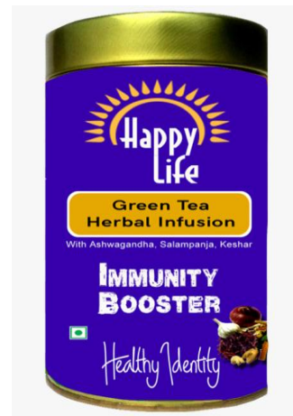
Figure 6: Happy Life's Green Tea Herbal Infusion for Immunity and Stamina (Beneficial In: Improving Immunity, Stamina and General Body weakness)