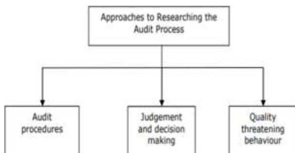
Figure 2: The Audit Process and Audit Quality

Earlier literature on the audit procedure that is pertinent to understanding audit quality can be classified into three principle fields of enquiry: first, research on audit methods as a portrayal of what auditors do, second, investigations of the idea of auditors' judgment and basic leadership and third, examination of the commonness of practices which may compromise or undermine audit quality These are appeared in Figure 2 and examined quickly straightaway