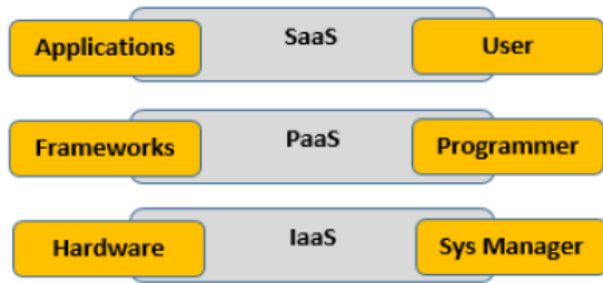
Figure 2: Services Layers of cloud computing