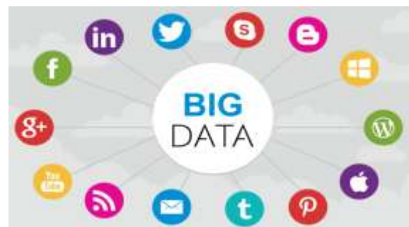
Fig. 3. Different ways of Big Data [6]

Single reaction engine will generate 10+terabytes of information in half-hour of a flight time. With several thousand flights per day, generation of information reaches up to several Pet bytes.