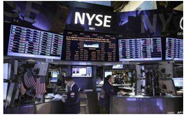
Fig. 1. Shows the N. Y. Stock Exchange supply of massive information [6]

Database management systems and desktop statistics- and visualization-packages typically have problem handling huge information. The work could need “massively parallel software package running on tens, hundreds, or maybe thousands of servers”. What counts as “big data” varies looking on the capabilities of the users and their tools, and increasing capabilities build huge information a moving target. “For some organizations, facing many gigabytes bandwidth for the primary time could trigger a necessity to rethink data management choices. For others, it’s going to take tens or many terabytes before information size becomes a big thought.” Example of big data. [4] [5] Following are some the examples of 'Big Data'-