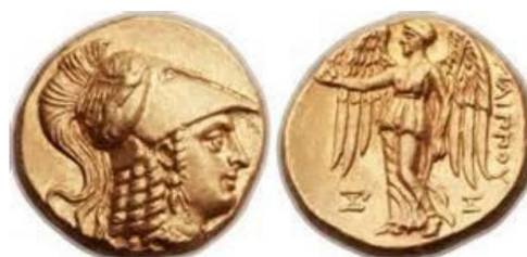
Philip III Arridaeus 323-317 B.C

The punch marked coins from the collections were very effective. These coins suggested that they must have been in circulation for a considerable time long before the advent of the coins of Arridaeus and Alexander. These coins were incidentally in mint condition. Carbon dating process manifests that these hordes of coins were buried approximately in 317 B.C. The archeological estimates suggest currency of these coins almost century older than their burial period of 317 BC. It leads to infer that there is no evidence to support the theory of the Greek origin of Indian coinage. Moreover, there is no similarity whatsoever between the punch-marked coins of India and the Greek drachm.