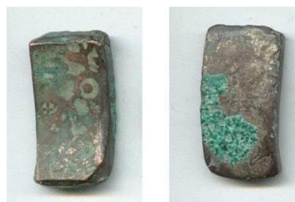
Mint Coins at Taxila 450 B.C

Coins: The innovations in Indian culture credited to the Hellenistic Greeks by the mostly scholars of the last century. It is a fact that the invasion of Alexander the great India came into close contact with the classical world, subsequently the Indian culture was influenced to a considerable extent by Greek culture. Indian history started to take this influence in 327 B.C with the invasion of Alexander in India. It was, therefore thought the coinage was also introduced into India by the Greeks of Bactria. However, now takes this argument seriously as there is the most persuasive evidence to prove the coinage existed in India before the Indians came in contact with the Greeks. In this context the discovery of Taxila of a large hoard of over a thousand punch-marked; together with two coins of Alexander the great and the coins of Philip Arridaeus is of great importance.