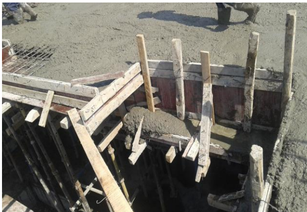
Fig 4. Wastages of Concrete