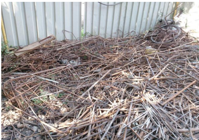
Fig 5. Wastages of Steel