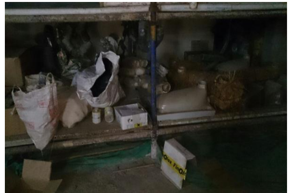
Fig 6. Wastages due to Improper Storage