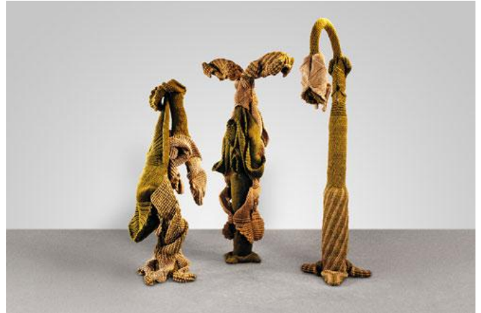
Fig. 4.1 (left) Phenomenal Nature, fibre, Mrinalini Mukherjee, 1984