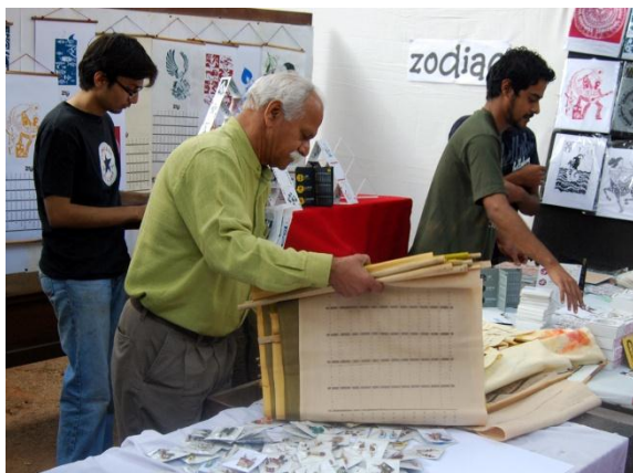
Fig. 3.2 (right) Screen Printed Calendars & T-shirts, 2009

Fine Arts Fair is an amalgamation of traditional as well as new teaching learning processes through workshops and experiments. Students are free to work in any department during this period. They exchange the departmental strengths and skills with each other. The workshops like natural dyes, metal casting, textile printing, book binding, weaving, bamboo crafts are few of them. The students learn patience, sincerity, marketing, working in groups and unity through this methodology.