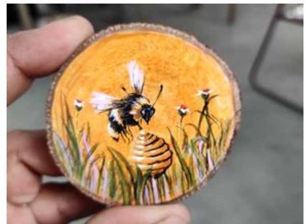
Fig. 2.4 (right) Painted wooden magnet, 2020

There are sayings e.g. "People can earn money by selling stones if they know how to sell it" and "Best out of waste". Students of Fine Arts work with those materials which are freely available and create best products for fair. The above images are just glimpses