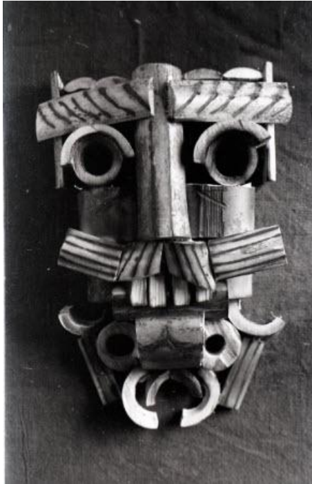
Fig. 1.2 (right) Bamboo Sculpture, 1967

His original idea of introducing this fair was to learn and explore new materials as well as various production techniques of art and craft and then bringing them into art and design.