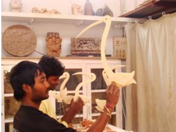
Fig. 3.1 (left) Wooden Toys, 2009