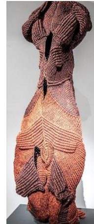
Fig. 4.2 (right) Yogini, fibre, Mrinalini Mukherjee, 1994

A preeminent voice within Indian contemporary art, Mrinalini Mukherjee is well known for her hemp rope sculptures and organic forms. Born in Mumbai, Mukherjee studied under KG Subramanyan, whose modest and earth bound materials informed her early works. Her knotted sculptures draw form a rich history of India's artisanal history, and have been described as simultaneously erotic, divine, human and vegetal.