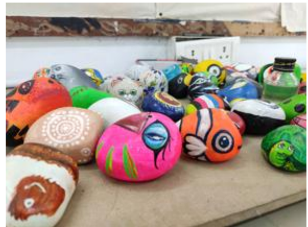
Fig. 2.3 (left) Painted stones, 2020

The above images shows that how interestingly the thread and the rope can be used for producing useful household and home decor products. They are beautifully crafted using various techniques. In the initial years of the fair, natural materials were broadly explored. Nowadays plastic, paper, fibre, metal, glass, rubber and foam waste are much trendy in the Fine Arts Fair.