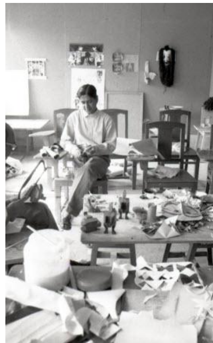
Fig. 1.1 (left) Prof. K. G. Subramanian is preparing for fair, 1967

The word 'Fair' itself suggests its meaning. People think of games, rides, toys, crafts, furniture, textiles etc. through this word. Here I am going to discuss on the 'Fine Arts Fair' of Faculty of Fine Arts, The M.S. University of Baroda. Prof. K. G. Subramanian (Padma Bhushan and Padma Vibhushan and Padma Shri awardee) started this tradition. The Fine Arts Faculty Fair started first time in 1961, taking inspiration from the fairs and 'melas' that were prevalent since early 20th century at the well-known art institution in Santiniketan, West Bengal. Sculptor Sankho Chaudhury, who taught at the Faculty, had initiated the Fair after having studied in Santiniketan. Besides the fun and festivities that it brought, the Fair served an important role in supporting less privileged students and in reaching out to the local community. It became an occasion where the public could view and buy artworks that were produced by students. Over the years, the Fair expanded in scale and scope, bringing into its fold different activities, such as theatre performances, puppet shows, experimental artworks, and traditional art forms.