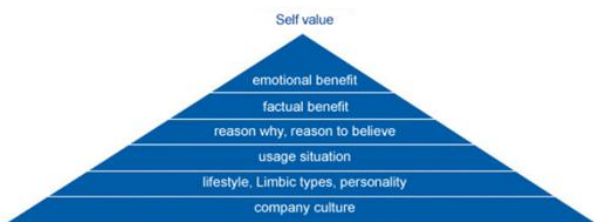
Figure x: Brand Positioning Pyramid (Paul, 2018)

Figure 1 shows the brand positioning elements for any type of product.