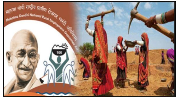
Figure 1 MGNREGA