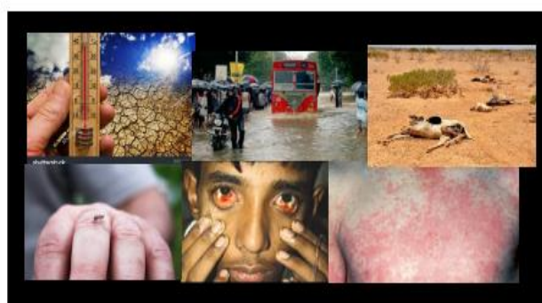
Figure 1: The Impact of Climate Change on Human Life

Interpretation: Over the past three decades, there has been a rise in heat waves, draughts, and floods. Between 1980 and 1998, 18 heat waves were recorded in India. Heat waves in Andhra Pradesh in 2003 resulted in over 3000 deaths, while heat waves in Odisha in 1998, 1999, and 2000 are reported to have caused 2000, 91, and 29 deaths, respectively. Since 2013, there has been an increase of draughts in Maharashtra. Bihar experiences floods every year, but the 2004 floods were exceptional due to their ferocity. Coastal flooding is becoming more common; one such instance occurred in Mumbai in July 2005, which claimed about 600 lives. In 2012, Delhi saw its worst summer in thirty-three years. Figure 1.