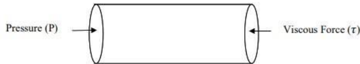
Figure 3: Direction of pressure and viscous force

When no external forces are exerted on a fluid, its total energy, or momentum, stays constant. This phenomenon is known as conservation of momentum. Thereby, momentum conservation will be upheld by the hepatic circulation system. The hydrodynamic pressure in both the red and white blood cells remains constant.