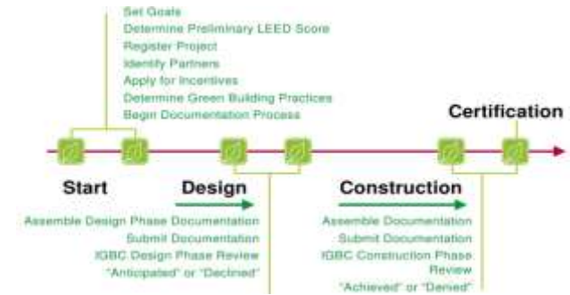
FIG.2 STEPS OF CERTIFICATION

building movement, through support of all stakeholders from the construction industry.