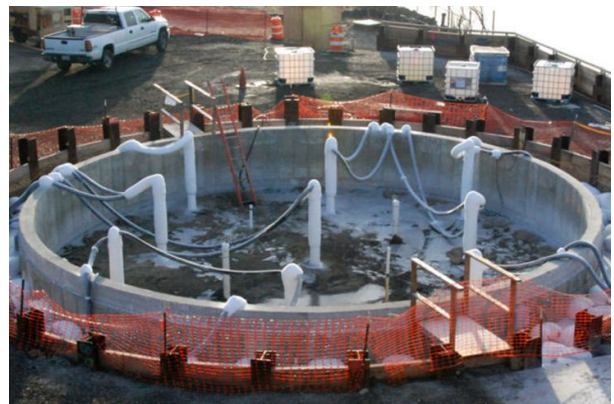
Figure 1.3: Deep Shaft

Ground freezing is a construction technique used in circumstances where soil needs to be stabilized so it will not collapse next to excavations, or to prevent contaminants spilled into soil from being leached away. Ground freezing has been used for at least one hundred years. Ground freezing is also used to provide regional groundwater barriers around mining operations for gold and other minerals, oil sands or oil shales. It is often referred to as ground freezing, soil freezing, or freeze wall. The ground freezing process involves drilling and installing a series of relatively closely spaced pipes and circulating a coolant through these pipes. The refrigerated coolant extracts heat from the ground, converting the soil pore water to ice resulting in an extremely strong, impermeable material. It is the most positive method of ground improvement used in the underground construction and mining industries.