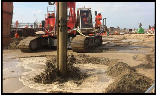
Figure 1.1: Vibro Compaction