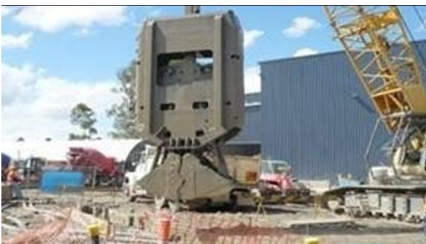
Figure 1.2: Vacuum Consolidation