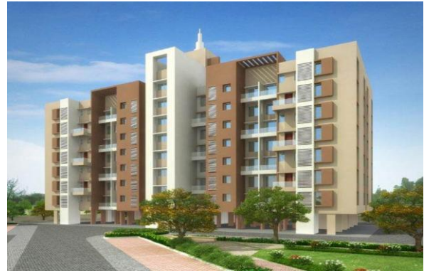
Fig 1: view Nithyam from outside, Charoli

entertainment destinations Then there is the pricing advantage Despite its proximity to major cities Mandala Park View is affordably priced Chakan MIDC and the Sant Dyaneshwar shrine are also nearby Due to its closeness to prestigious educational institutions banks and convenience shops a house here gives convenient access to lifestyle amenities.