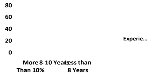
Graph 1: Experience of respondents (years)