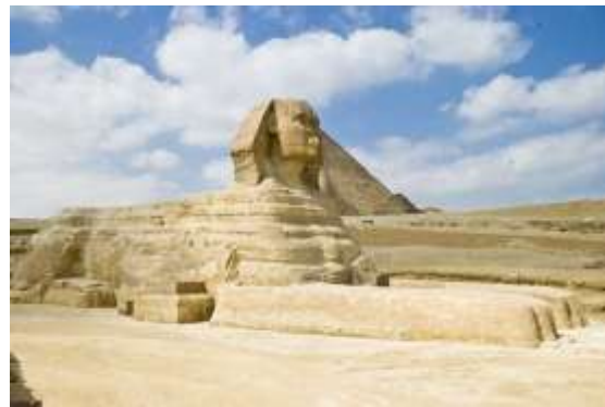
The sphinx, Egypt

Gigantic stone carved sculptures depicting mythical creatures, animals and human forms ensembled with monumental architecture show refined artistry and expression. 6 These examples prove the inspiration environment projects for art and aesthetic in human life.