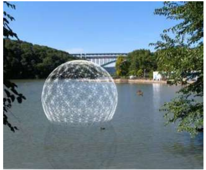
"Harvest Dome" Inwood Hill Park 2011.

the sculpture artists gave an inspiring aspect of waste recycling and reusing 450 discarded umbrellas and 128 emptied bottles to make something productive. It attracted the attention of society towards consumerism and increasing level of non biodegradable waste on the planet.[11]