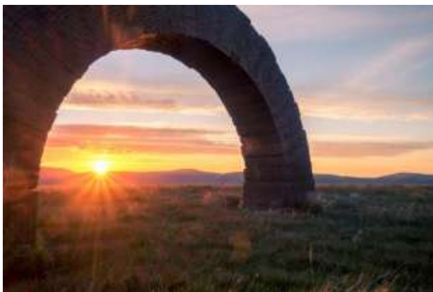
Andy Goldsworthy, "Striding Arch at Benbrack"

Andy also does similar installations with found materials and documents the changes time and weather play over them. British artist Andy Goldsworthy's outdoor sculptures were created on site and out-of-doors, in areas where he found a range of natural materials - from snow, ice, and boulders to leaves, twigs and mud - which he then used to build art works which were often short-lived, subject to the whims of the environment they occupied.[10] His works talks about fleeting moments in the cycle of life and how change is the only constant.