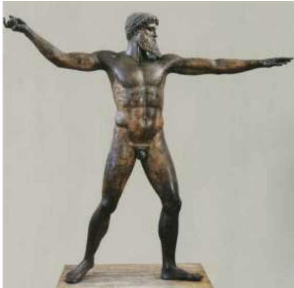
The statue, portraying Zeus or Poseidon

When we look into Egyptian and Greek civilizations and their approach towards art we come across more mature and developed expression. The huge metal sculptures of Greek period show great understanding of metallurgy and stone carving both materials found within nature and transformed into medium of art expression.[5]