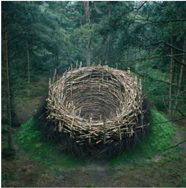
Nils Udos, "The Nest"

Assemblage of wooden twigs and creating pattern with fallen leaves create a dreamy visual done in remote areas like forests river sides etc.