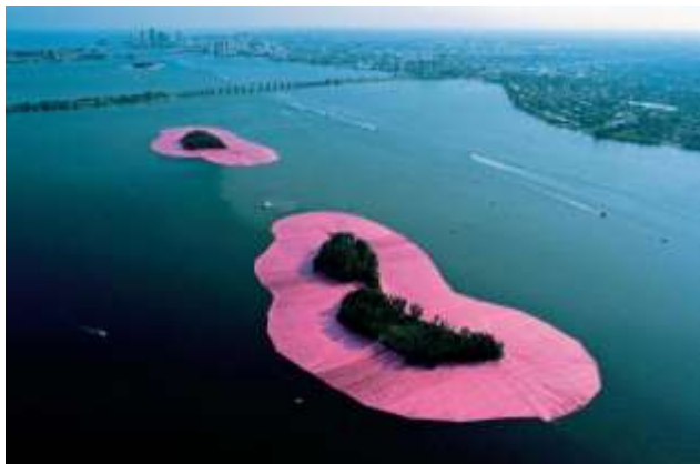
“Surrounded Island”, Miami, Florida 1983 8

bodies through land art. The installation was intended for attracting viewers with vibrant visual and creating awareness amongst the residents regarding pollution and disposing of waste in water bodies.[8]