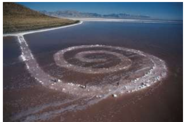
"Spiral Jetty" Salt Lake, Utah 1970.

Robert Smithson, known for his observation based land art. His "Spiral jetty" (1970) work is a 1500 foot long spiral made of stones and natural material extended in the salt lake of Utah. It's a site specific work which keeps on changing due to submergence of the form in water in specific seasons. This work of art is like an iconic statement by artist against commoditization and ownership of art in market and restriction of art within galleries.