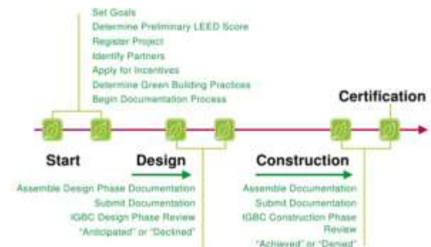
FIG. 2 Steps of Certification

Triggering off the Green building movement in India is the first Platinum Green Building in India; Sohrabji Godrej Green Business Centre in Hyderabad as per the IGBC rating system. This landmark achievement put India on the global map of green building movement, through support of all stakeholders from the construction industry.