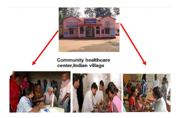
Figure 1: Primary health-care center and services to community population (view from an Indian village). Primary health care (PHC) refers to a broad range of health services provided by medical professionals in the community. This means universal health care is accessible to all individuals and families in a community. General health-care practitioners, nurses, pharmacists, and allied health-care providers are exclusive components of the primary health-care team. Basically, the PHC service is the process and practice of immediate health services, including diagnosis and treatment of a health condition, support in managing long-term health care, including chronic conditions such as diabetes. PHC also includes regular health checks, health advice when an unhealthy person seeks support for ongoing care In India, the government has fixed specific norms for primary health center, based on of community structure and population