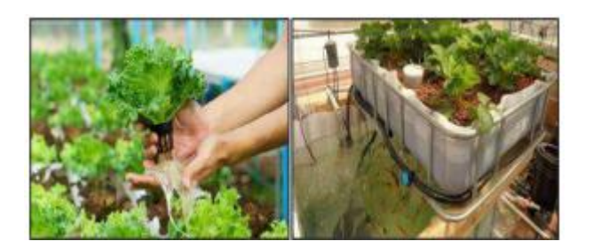
Figure 5: Aquaponics & hydroponics in Maharashtra, India

(the farming of fish) with hydroponics (the cultivation of plants in water) by reusing the water used to cultivate the fish as a source of nutrients for the hydroponically grown plants. Both of these systems can be found in a variety of sizes, ranging from those suitable for use in the house to those used in large-scale businesses.