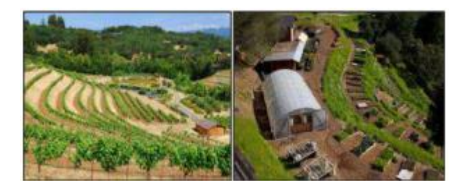
Figure 3: Biodynamic farming in Gujarat, India's BhaikakaKrishi Kendra

a long time to increase soil health, with "dynamic" practices, which incorporate the impact of cosmic energies to infuse the farm, its inhabitants, and its products with vitality (Sharma, 2012). Cow manure, silica, & extracts of various plant parts, such as yarrow flowers, chamomile flowers, oak bark, stinging nettle shoots, and so on., were reported as the main ingredients in some biodynamic preparations by Reeve et al. (2011). These ingredients are either useful through field spray or composting.