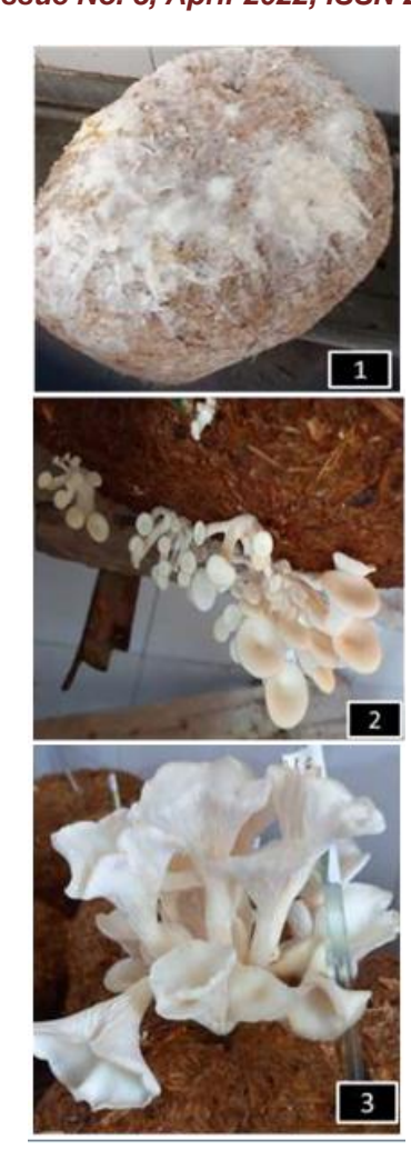
Figure 1: different stages of pleurotus sajor -caju's growth 1) Spawn run throughout the wheat substrate after 15 days. 2) Development of pinning can be seen by appearance of young basidiocarps on wheat substrate. 3) Mature mushroom/ mature basidiocarps can be seen with gillson their surface and they are ready to harvest.