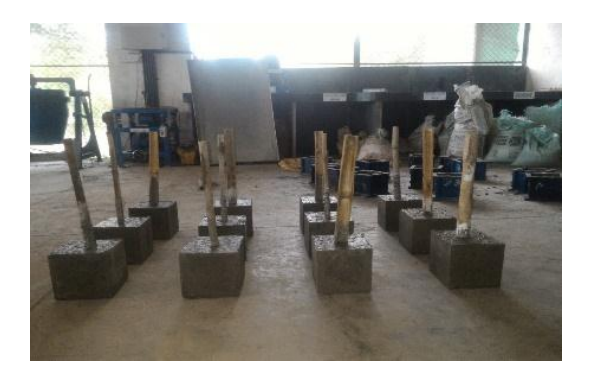
Figure 1 Remolding cubes and cured for 28 days

Pull out test on bamboo is to be carried out by a special apparatus which is sustainable to make a proper grip with bamboo. In this test we calculate and observed deflection (in mm) of bamboo on a given particular load (KN) first we took cubes having standard size 150*150*150 mm and then using proper proportion of cement sand aggregate and water we made an homogenous mixture of concrete and then bamboo strips on which we already perform and improve their physical and mechanical properties are prepared to ready for casting. Bamboo strips cutting should be of 300mm. then we go through first step which includes three samples of plain bamboo which are polished by sand paper. While casting give a cover for bamboo strip and once first layer is casted on cubes then hold the bamboo strip straight in middle of cubes and then cast the cube as per standard procedure. Similarly all the specimen with different coating should be casted each of three samples and after then all cubes are lay down for curing after which we are going to perform test on them after 7,14,28 days and calculate the readings and plot the graph to show the differences in bonding.