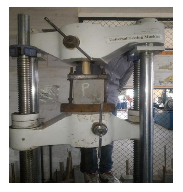
Figure 2 Assembly ready for pull-out test on cubes