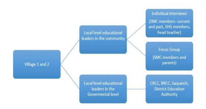
Figure 1 Meetings of individual and central meetings held at the municipal and administrative level in villages 1 and 2

100 of the 272 public schools (38 Nichar, 27 Kalpa and 35 Pooh) were selected. In each school reviewed, a teacher (the principal / principal coach / principal coach available upon receiving the information collected by the principal of the school) and the president of the SMC were included in this example. In this way, the sample included 100 educators and 100 MSC directors. The proper use of the coaches example, SMC bosses, appeared in the tables